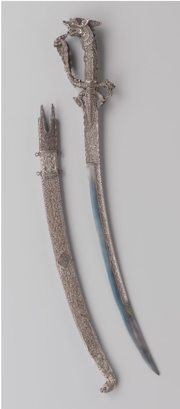
Rijksmuseum, Amsterdam, inv.no. NG-NM-7112

In collaboration with Senarath Wickramasinghe (National Museum, Colombo)