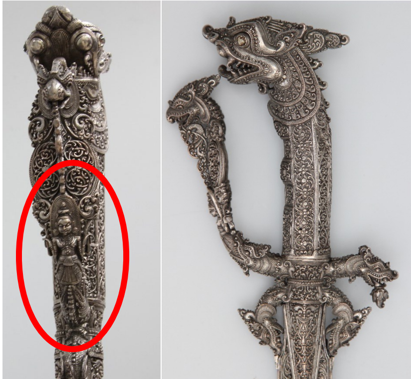
Photos 3 and 4: Nari Lata on silver mounted kashhane (Rijksmuseum, Amsterdam, inv.no. NG-NM-7112).

Furthermore, Wickramasinghe tells us: “The quilion (Varisarkuva) is shaped in the form of a makara (dragon) head. The Ricasso has a long rectangular silver overlay and liyapata decoration. The blade (Kadupatha) is more curved and decorated than the golden sword (NG-NM-560) and single fuller and it extends to near top of blade. The blade is decorated with a liyavela design.” 16