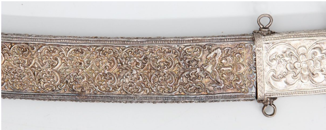
Photos 5 and 6: Details of the scabbard. Notice how the kibihi-muna (lion face) is used as starting point of the flower pattern. (Rijksmuseum, Amsterdam, inv.no. NG-NM-7112).

Based on the exceptionally fine silverwork, it is concluded that the silver kasthāné was made in the Four Workshops of the Kandyan King. Kasthāné produced in the royal workshop were all of high quality, yet the exact quality in terms of design, decoration, and material of the kasthāné signified the rank to whom the object was gifted: the more decorated (i.e. use of figures, gems, silver, gold), the higher the rank of the receiver. 20 The object analysis does not provide us with further evidence about the intended owner of the kasthāné , except that the exquisite use of silver and gems suggests it was exclusively made for one of the adigars , or other members of the highest aristocracy at the court. 21